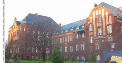
„Alte Nervenklinik“ Charité, Berlin

Brandenburg Gate and Potsdamer Platz at night, Berlin