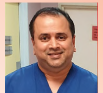
Asri RANGA Serdang Hospital MALAYSIA